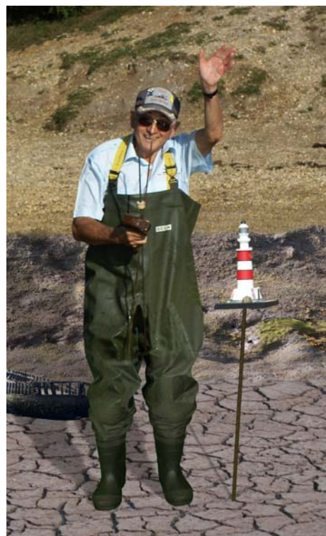
The Scale Captain drains Setley Pond - more shocking pictures inside!