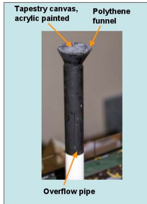
Final funnel assembly

required dimensions. The mist maker works best in up to 65mm water depth and switches off at 45mm depth (the depth sensor is the black chess pawn shaped thing in the picture). The maker's body is 40mm in diameter and it uses 90ml/hr. That means if you used a pipe into which it would just fit, you would need to refill the water every 17 minutes! Also the mist maker creates a fountain of water above it, so you need to be able to position the fan away from that. All this implies that we can only fit it in larger models and that a oil based generator is the better bet for smaller models. I used a food container, but such containers are usually wide compared to deep. I now realise that the plastic containers for washing machine liquid sachets are a better shape, are free, and come in different sizes (small at the Coop, larger at Waitrose!).