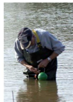
The Scale Captain adjusts the Setley Pond ball valve.