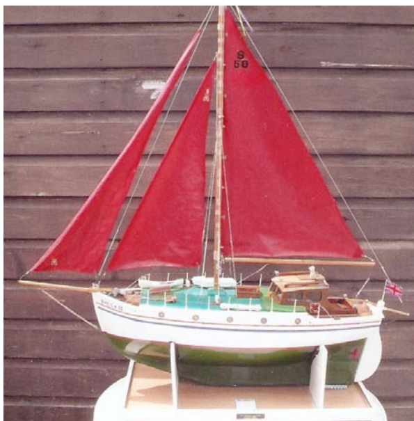
"Sheila" (left) £250