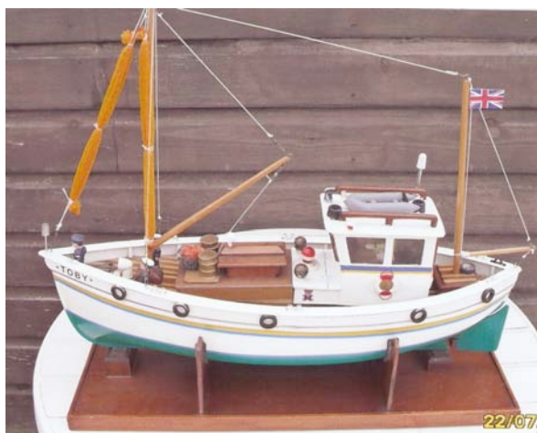
Toby (above) £150