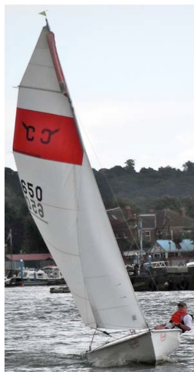
My other boats are... smaller than this!