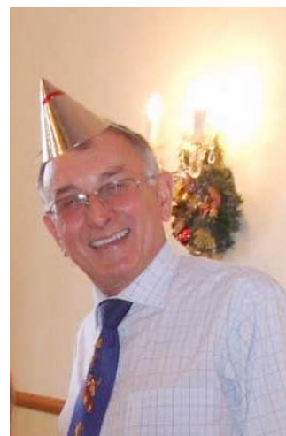
The Scale Captain must have been reading the Christmas lunch menu included in this newsletter!