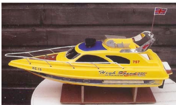
Yellow Speedboat £50 (above)