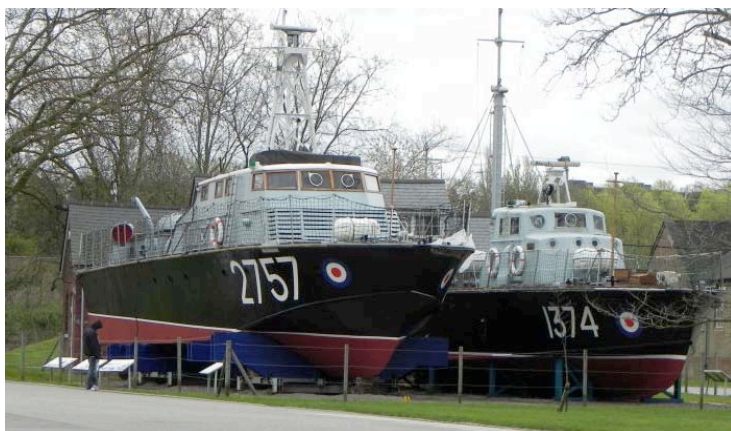
RAF Launches at the RAF Museum, Hendon

Most people in the club only know me because of my hovercraft. What they do not know is that I also have a passion for British Military Aviation and am actively involved in aircraft restoration work at Boscombe Down air base near my home in Salisbury.