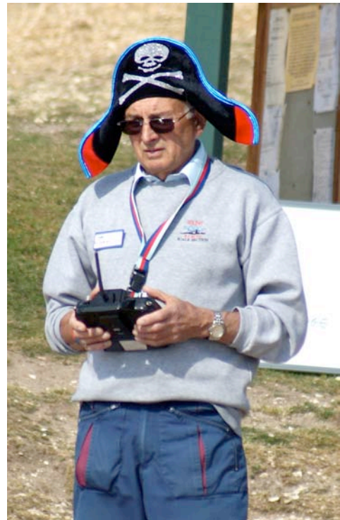
"Now, which channel controls my parrot?"