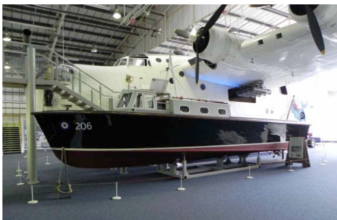
RAF Seaplane Tender 206 at RAF Museum, Hendon.