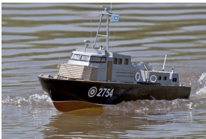
Pete Bryants model of a Rescue Target Towing Launch in action on Setley Pond

At the RAF Museum in Hendon, north London there are 3 RAF motor launches. Outside is Rescue Target Towing Launch [RTTL] 2754. Alongside is RAF Pinace 1379. These boats have been restored by volunteers like myself. In this case by members of the ex-RAF Marine Branch. For some reason the powers